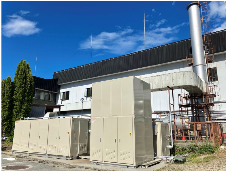
CO 2 separation and recovery equipment